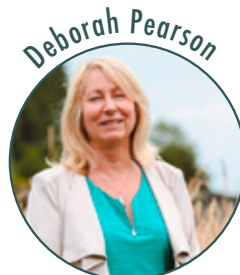
MANAGER OF FINANCE & ADMIN