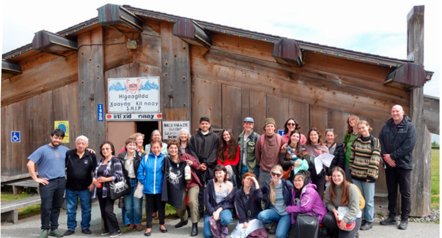
Visiting Higaagilda Xaayda Kil Naay Skidegate Haida Immersion Program to learn about their important language work and get whooped at Diigwey bingo

that students really treasure. We are so grateful to the people who join our programs year after year, to generously share their knowledge and support our shared vision for education inspired by Haida Gwaii. Some of our Community Educators have become curriculum developers, course instructors, and other types of partners. Hawaa | Haw'aa to our amazing Community Educators for sharing so much with us!