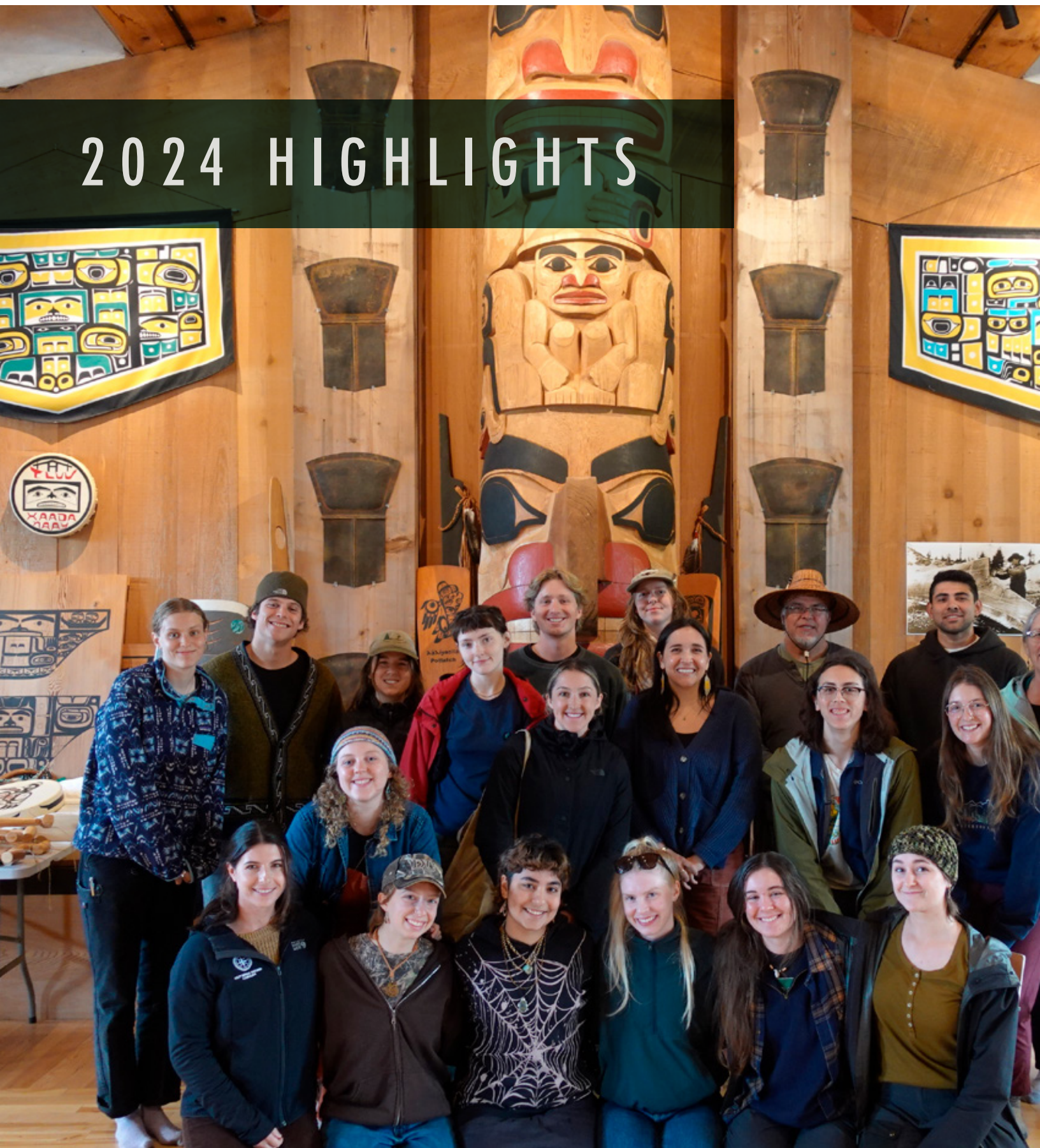
The '24 summer class visiting Tluu Xaada Naay Ocean People's House