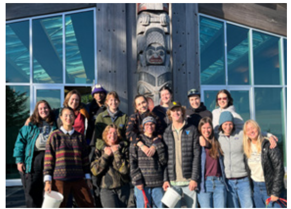
The '24 fall semester class at the Haida Heritage Centre

To all of our students: thank-you for showing up with curiosity, care, and