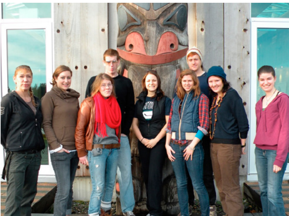
First class photo at the Haida Heritage Centre