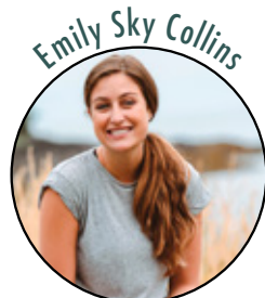
PROGRAM & OPERATIONS MANAGER