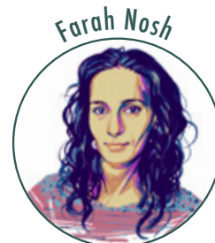
ONLINE ADMISSIONS COORDINATOR